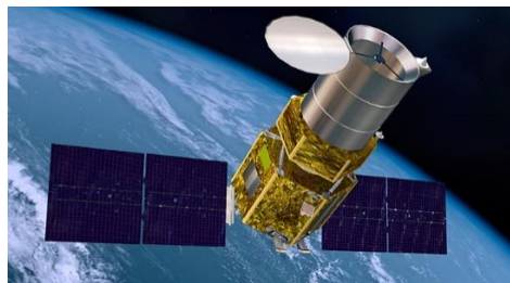
Jitter Measurement/Compensation in Imaging Satellites