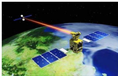
Line of Sight Stabilization in Optical Communications