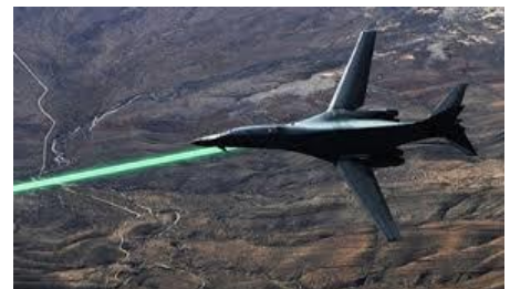
Jitter Control/Rejection in Directed Energy Systems